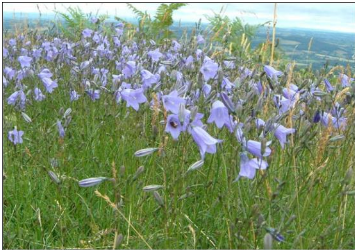
Figure 1: Harebells on the Malvern Hills.

The Malvern Hills is one of the only sites in the West Midlands that has a significant area of acidic wildflower grassland. The Malvern Hills are notified as a Site of Special Scientific Interest (SSSI) by Natural England mainly due to this large