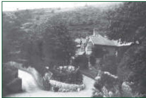
Earnslaw House c.1929, view from the North

The water filled quarry now forms part of the Malvern Hills Site of Special Scientific Interest which is an area of special interest designated by reason of its flora, fauna, geological or physiographical interest with the aim being to protect valuable habitats.