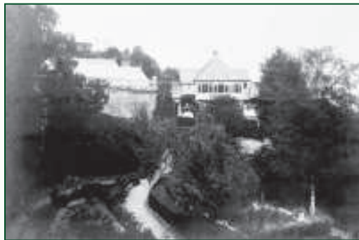
Earnslaw House c.1929, view from the South