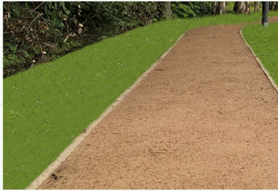
Hoggin surface: Compacted, fine-screened 'hoggin' surfacing, nominal 50mm compacted layer over min. 150mm Doft Type 1 sub-base; softwood timber edging, pegged in place.