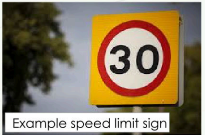
Example speed limit sign